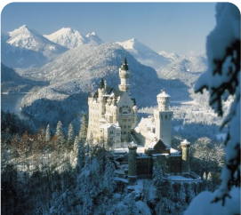
Neuschwanstein Castle Fairytale Castle of 'Mad' King Ludwig