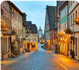
Rothenburg Night Watchman Walking Tour