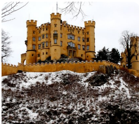
Hohenschwangau Castle Guided Tour