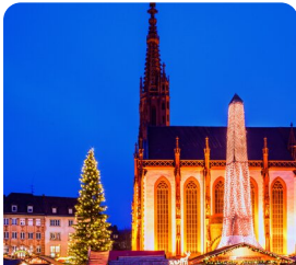
Würzburg Christmas Markets

These are just a few of the very special hand selected experiences that will really make your touring experience exceptional and unique, and don't forget, with Albatross they are always included.