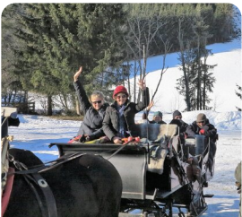
Horse and Carriage Ride Through the Local Countryside