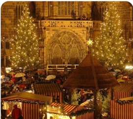
Nürnberg Christmas Markets