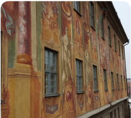
Bamberg UNESCO World Heritage Site