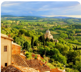
Val d'Orcia Stunning countryside and open vistas