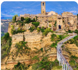
Civita di Bagnoregio Hilltop town

These are just a few of the very special hand selected experiences that will really make your touring experience exceptional and unique, and don't forget, with Albatross they are always included.