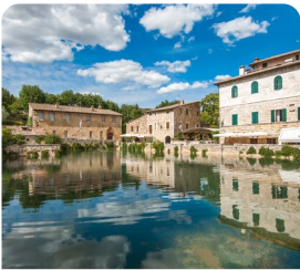
Bagno Vignoni Peaceful little town