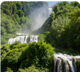
Waterfalls of Marmore Europe's highest man-made waterfalls