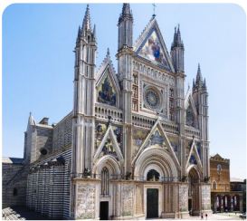
Orvieto Cathedral Walking tour