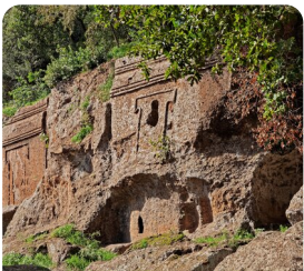
Etruscan Necropolis Guided tour