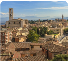
Perugia Local guided tour