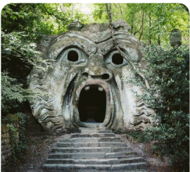
Sacro Bosco Park of the Monsters