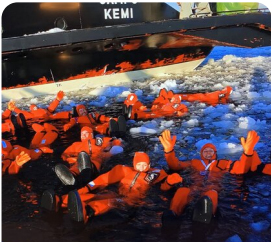
Ice Breaker Cruise Baltic Ice Breaker & swim with icebergs