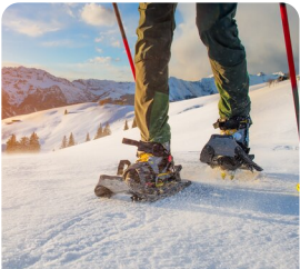
Snow Shoe Walk Through the Local Countryside