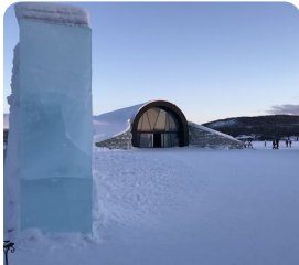
Jukkasjärvi Stay in the famous ICEHOTEL