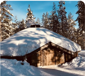
Sámi Village Visit the Sámi Village Cultural Park