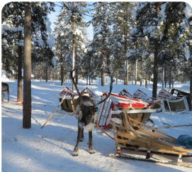
Arctic Reindeer Centre Go reindeer sledding