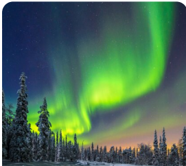
Aurora Borealis Go Aurora spotting

These are just a few of the very special hand selected experiences that will really make your touring experience exceptional and unique, and don't forget, with Albatross they are always included.