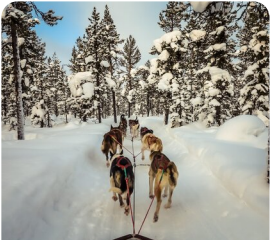
Husky Ride Ride with huskies in the Swedish wilderness