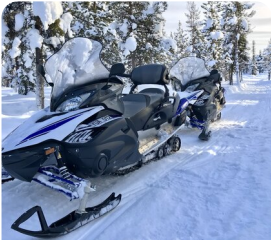
Snowmobile Safari Enjoy an escorted night time safari