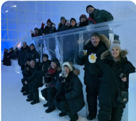
ICEHOTEL Ice Bar Enjoy a drink in the famous Ice Bar