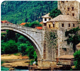
Mostar Guided tour