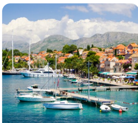
Cavtat Cruise and dinner