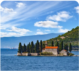
Our Lady of the Rock Boat cruise