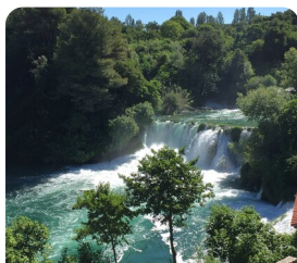
Krka National Park Boat trip to Skradin

These are just a few of the very special hand selected experiences that will really make your touring experience exceptional and unique, and don't forget, with Albatross they are always included.