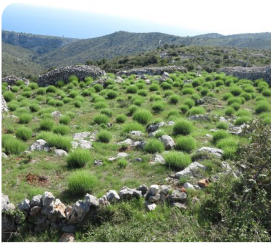
Lavender road Lavender blooms on Hvar throughout the month of June