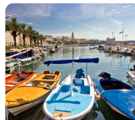
Split & Trogir Walking tour