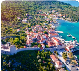
Mali Ston Oyster Tasting and a Lazy Lunch