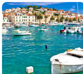
Hvar Ferry ride