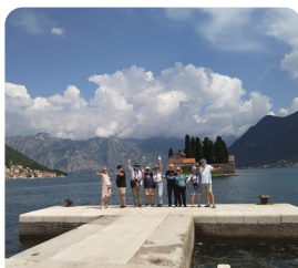
Montenegro Full day tour