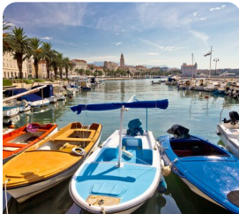
Split Klis Castle & Guided Walking Tour

These are just a few of the very special hand selected experiences that will really make your touring experience exceptional and unique, and don't forget, with Albatross they are always included.