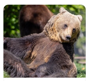
Libearty Bear Sanctuary Europe's largest animal welfare project