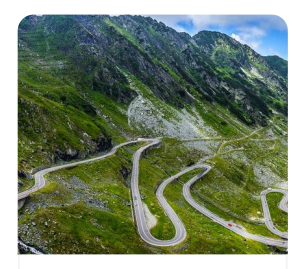
Transfăgărășan Highway Travel the hairpin bends of the stunning Transfăgărășan mountain road