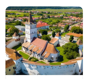
Prejmer Fortified Church One of a collection of seven UNESCO listed fortified churches