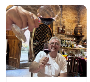
Rogljevačke Pivnice Historical Wine Village