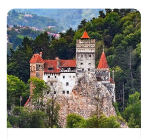
Bran Castle Private tour of 'Dracula's Castle' and Dinner