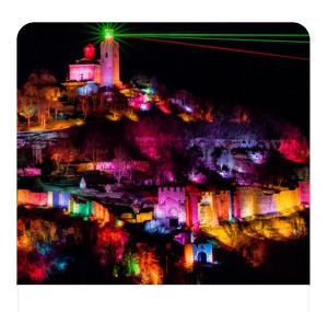
Veliko Tarnovo Sound and Light show