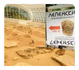
Lepenski Vir One of Europe's most important archaeological sites