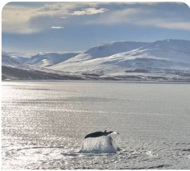
Whale Watching Cruise On an Icelandic Oak boat