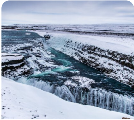
Gullfoss Falls Visit Gullfoss Falls