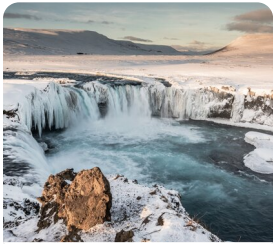
Goðafoss Goðafoss Falls

These are just a few of the very special hand selected experiences that will really make your touring experience exceptional and unique, and don't forget, with Albatross they are always included.