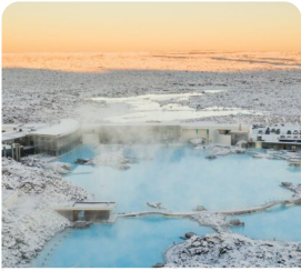
Blue Lagoon Thermal pools