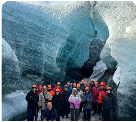
Jökulsárlón Glacier Lagoon Visit the Glacier Lagoon and Blue Crystal Ice Cave