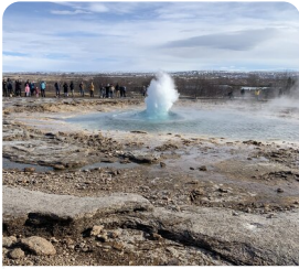
Geyser Hot Spring Geyser Hot Spring thermal area