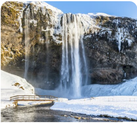
Seljalandsfoss waterfall Visit the stunning waterfall