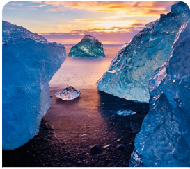
Diamond Beach Walk along the Diamond Beach