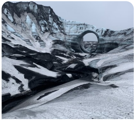
Katla Ice Cave Excursion to the Katla Ice Cave