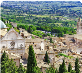
Assisi Discover Assisi with a local guide