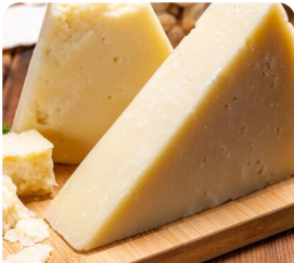
Mondaino Pecorino Cheese tasting