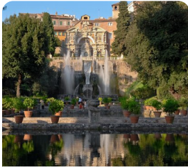
Villa D'Este UNESCO Heritage gardens