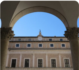
Ducal Palace Visit Ducal Palace & Mussolini's favourite bar