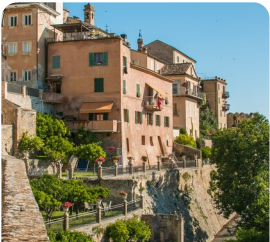
Grottamare Adriatic coast