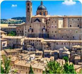
'Le Marche' Rolling hills & vineyards of Le Marche