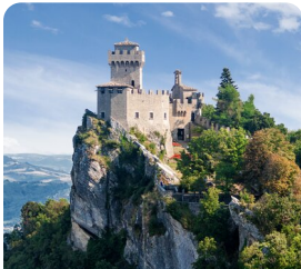
San Marino Cable car ride

These are just a few of the very special hand selected experiences that will really make your touring experience exceptional and unique, and don't forget, with Albatross they are always included.