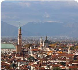
Beautiful Vicenza Guided walks