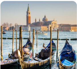
Venice Private boat to St Mark's Square