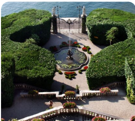
Villa Carlotta Explore ornate rooms & gardens

These are just a few of the very special hand selected experiences that will really make your touring experience exceptional and unique, and don't forget, with Albatross they are always included.