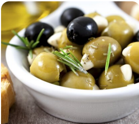
Olive Oil Tasting Tuscan farmhouse