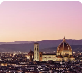
Florence Locally guided city tour