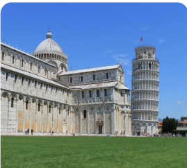
Pisa Leaning Tower of Pisa