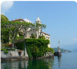
Lake Como Private cruise on pretty Lake Como