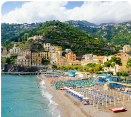
Amalfi Coast Ferry ride along the Amalfi Coast