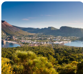
Vulcano Panoramic Drive