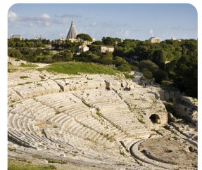
Syracuse & Ortigia Ancient Ruins & a Historical Centre