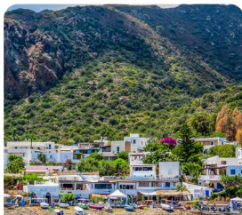
Panarea and Stromboli Afternoon Cruise & Evening 'Stromboli Fireworks'