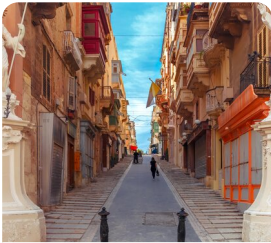
Valletta Guided walking tour and visit The Malta Experience